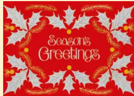
CY-S286 'Holly Leaves' Best Wishes for a Happy and Prosperous New Year ₹ 55.00 (19.5 cms. x 14.3 cms.) (Gold and Silver Foil - finished card)