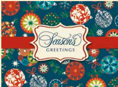
CY-S285 'Eternal Joys' Best Wishes for a Happy and Prosperous New Year ₹ 55.00 (19.5 cms. x 14.3 cms.) (Glitter and Foil with Embossing - finished card)