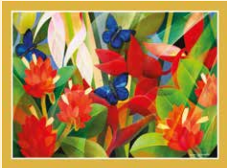
CY-E307 'Bright Flights' Artist: Senaka Senanayake Season's Greetings ₹ 50.00 (19.5 cms. x 14.3 cms.)