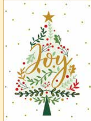
CY-A295 ‘Joy Tree’ Season’s Greetings ₹ 45.00 (13 cms. x 18.5 cms.) Gold Foil-finished Card