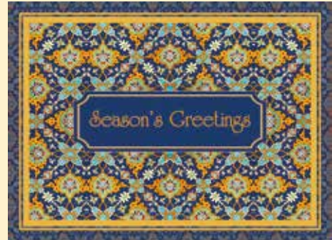
CY-E308 'Regal Splendour' Best Wishes For A Happy And Prosperous New Year ₹ 55.00 (19.5 cms. x 14.3 cms.) Gold foil - finished card