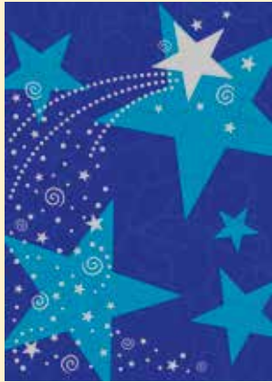
CY-A294 ‘Twinkling Stars’ Season’s Greetings ₹ 45.00 (13 cms. x 18.5 cms.) Silver Foil-finished Card